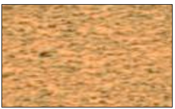
Humanoid bodies on Mars - The man

In this detail ( below ), we can see hundreds of human bodies, tightly packed, as if decaying in a sticky morass. The body of a male dressed in a white shirt and blue pants is visible at lower left.