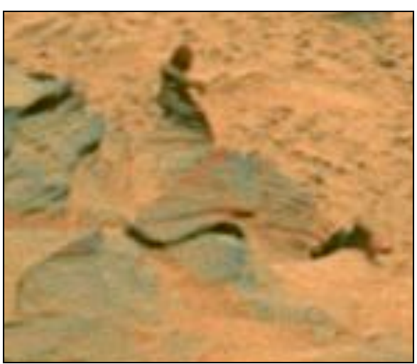
Statue on Mars showing reptile biting human