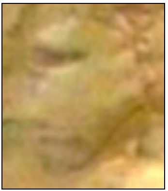
The Humanoid Face

In this detail ( below ), the humanoid face can be seen. The face has eyes, a nose, and a mouth.