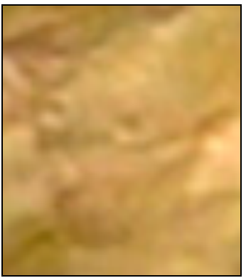
The Reptoid Face

The face next to it (below) is very dinosaur-like.