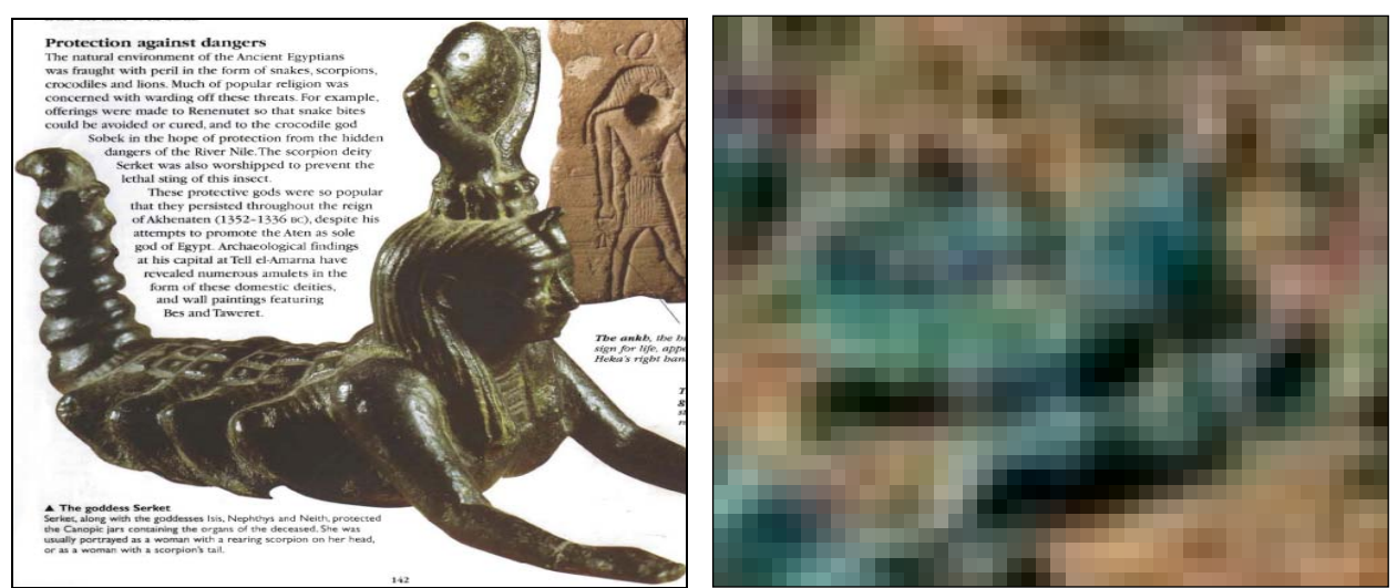
Serket, the scorpion goddess of Ancient Egypt (Strudwick, 2006) ( left ) was probably inspired by the scorpion-men of Mars, like the one discovered in the Columbia Basin (Basiago, 2008) ( right ).

I found the first scorpion-human on Mars in the modern era, The Scorpion Man, in NASA image PIA10214 and wrote about it in The Discovery of Life on Mars (2008). The Scorpion Man can be seen in the upper right part of PIA10214 amid the blue rocks that I named The Turquoise Field ( below right ).