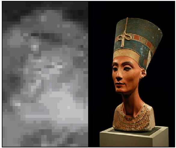
The Face of a Pharaoh on the Rosetta Stone of Mars reveals Ancient Egypt-Mars Linkage

The evidence on Mars of this ancient civilization consists of very large monuments that can be seen from satellite images and now smaller details photographed by NASA's rovers Spirit and Opportunity , such as the image of an Egyptian pharaoh that MARS has identified on a rock on Mars that was photographed by Spirit , that we are calling "The Rosetta Stone of Mars" ( below ) because it establishes the connection between Ancient Egypt and Mars.