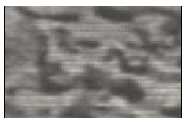
A Male Victim of the Catastrophe on Mars