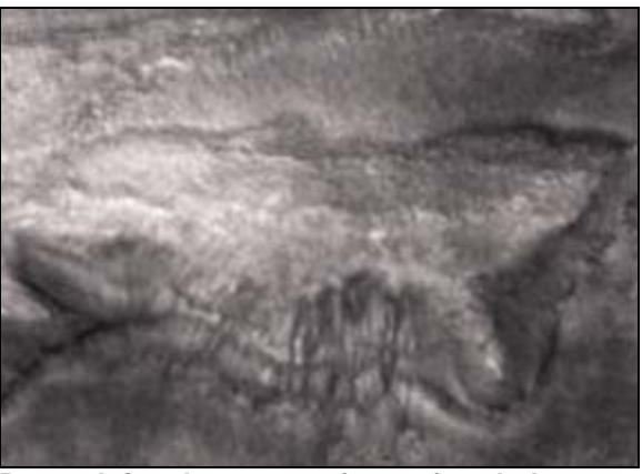
Beneath it, a large terra-form of a whale