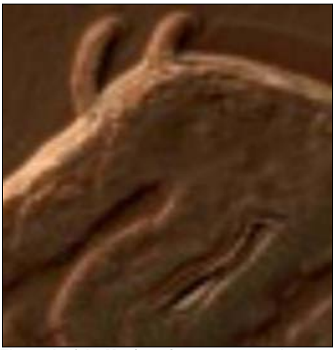
The teeth of the Martian minotaur as seen close up.