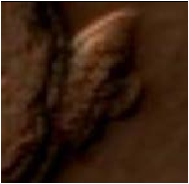
An elfin form has the minotaur under observation.