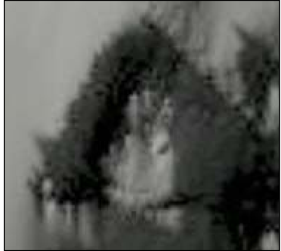
The Lizard Face of the Loire Valles