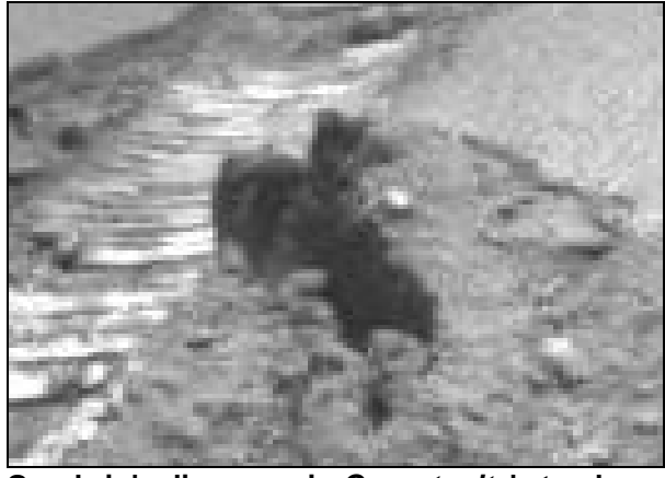
Goodwin's discovery in Opportunity's tracks

The image was subjected to additional analysis by Basiago, who made a startling set of discoveries.