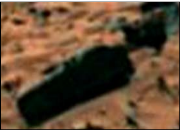
Image 3- The sarcophagus of an Egyptian pharaoh found by Basiago on the Home Plate Plateau of Mars in image PIA10214 bears the turquoise, drab green, and rust red colors that High Egyptian statues possess, revealing the Ancient Egypt-Mars connection