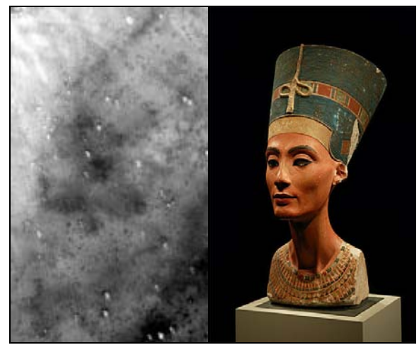
Image 2 – The Nefertiti Profile on Mars ( left ) found by Van Flandern resembles the iconic bust of the Egyptian royal consort Nefertiti that German archaeologist Ludwig Borchardt found at Amarna, Egypt in 1912 ( right ), whose hat shows distinctively Martian colors