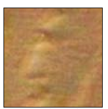
In the Ruell Vallis of Mars, vast terra-forms of faces of hominids at different levels of evolution