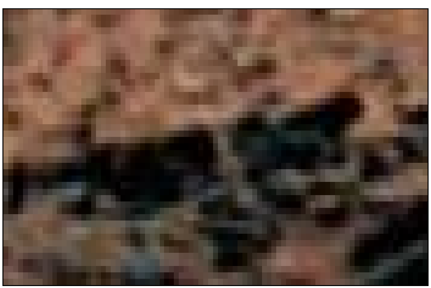
Figure 1. The Grotesque Humanoid Skull in the Rock Garden

This is the detail that Basiago was describing when he wrote this passage, Figure 1 (below):