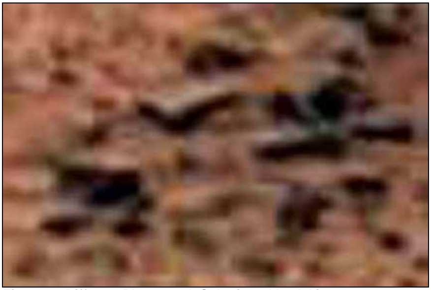
Figure 2. Different Photograph Substituted by Atkinson

In her "attack piece" in Universe Today , however, freelance writer Atkinson substitutes Figure 2 ( below ) for the original photograph included in his paper by the Cambridge-educated lawyer, which is Figure 3 :