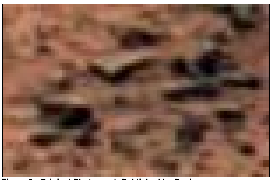
Figure 3. Original Photograph Published by Basiago

Next, Atkinson distorts Basiago's evidence by altering the quality with which his original image, seen in Figure 3 ( below ), is reproduced in the version of it that she posted online, Figure 2 ( above ). In Atkinson's version of the photograph, vertical banding has been placed over the scene. This obscures the presence of humanoid beings in blue bodysuits that are readily observable in the original photograph.