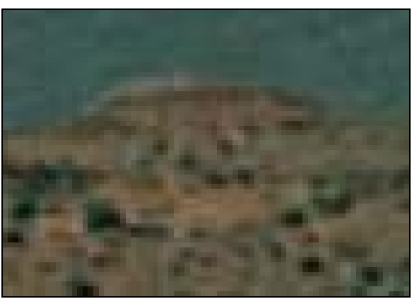
At water's edge, a platypus-like animal stays where a group of Martian humanoids plays