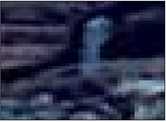
In PIA11049, water cascades from a viaduct